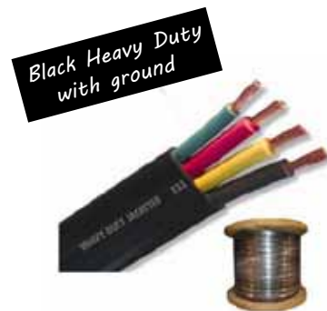
Black Heavy Duty with ground