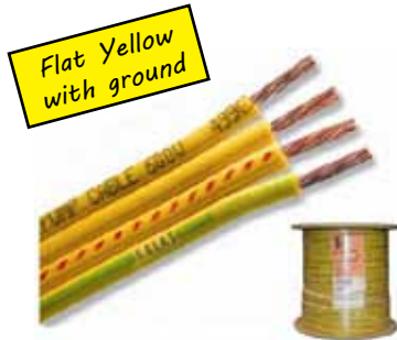
Flat Yellow with ground